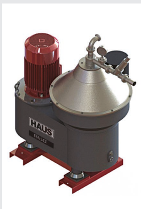
F Series Food Applications