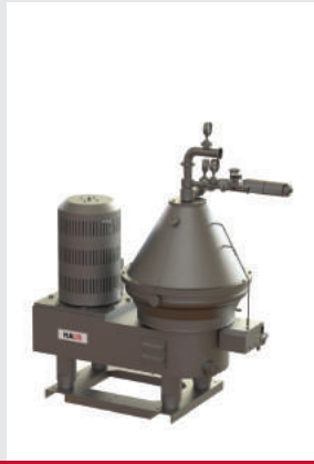
MAXCREAM Series Milk Applications