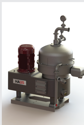
I Series Fish Applications