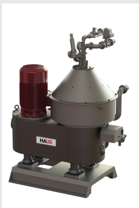
M Series Mineral Oil Applications