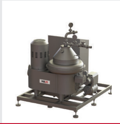
MAXCLEAN Series Milk Applications