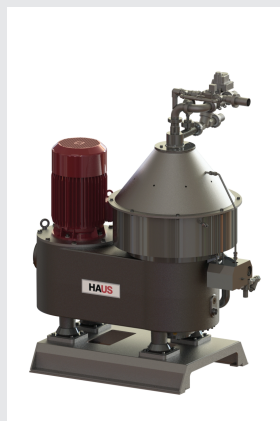
I Series Industrial Applications