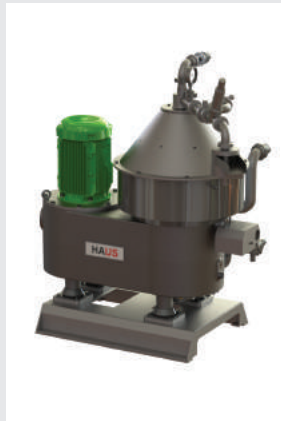
V Series Olive Oil - EVOO