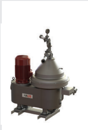
S Series Vegetable Oil Refining